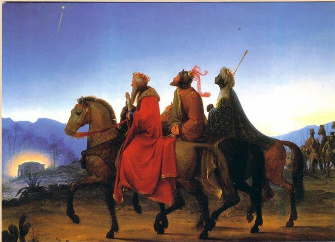
Leopold Kupelwieser (1825), The Journey of the Three Kings

As the sages and the camels pass through the last portal into the starlit dunes, their weights normalize. They ride into the distance as the portal fades behind them.