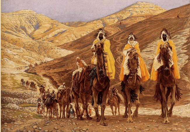
James Tissot (1894), The Journey of the Magi (Public Domain)

This is a 4-5 hour adventure for 2-6 first level characters and is intended to be accessible to new players and dungeon masters. It is a standalone adventure, though may be suitable as an opening episode to a continuing story. It uses 5th edition Dungeons & Dragons rules and may be run with basic rules (available free here: http://dnd.wizards.com/articles/features/basicrules ) or a Dungeon Master's Guide and Player's Handbook .