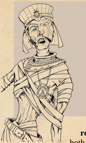
Left: LadyofHats (2017), Mummy (CC0 1.0)

Should the adventurers ask the sphinx why it is there, it will reveal that it has gotten lost and it asks and solves riddles from habit. It can be bribed or otherwise convinced with Charisma checks to allow the adventurers to pass.