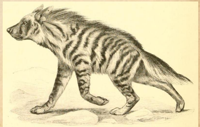
Frank E. Beddard (1902), Sketch of a striped hyena (Public Domain)

As free actions, at the start of the third round, the party makes the following group skill checks: DC 11 Intelligence (Nature): These striped hyenas are usually scavengers.