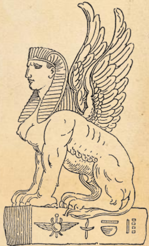
Manly Palmer Hall (1928), Ædipus and the Sphinx , from Chapter 6 of The Secret Teaching of All Ages (Public Domain)

The pyramid entrance leads to a 10 foot wide unlit winding passage of wild threads. As the adventurers progress, the walls transition to rough hewn stone, then worked stone, then richly painted stone. Retracing steps does not lead back to the embroidered ziggurat, only to further stone passages. The stone is painted with hieroglyphics. A successful DC 13 Intelligence (History) or DC 15 Intelligence (Arcana) check reveals the walls tell a story of a great battle in which two governors were slain at the head of their troops. The governors were political rivals in life, but are interred together. The passages lead to stairs heading down, then up.