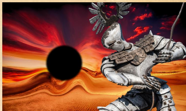
Planar anomaly in combat

Having boarded the asteroid, likely using the potions of vaulting, a magical blue glow emanates from a cavernous hollow in the asteroid. Upon entering the hollow, represented by 2 Map Grids laid 1x2, the adventurers are beset by 2 Ember Elementals and 2 Minor Planar Anomalies . These are immediately hostile and will fight to the death. The hollow is unlit apart from the light of the ember elementals.